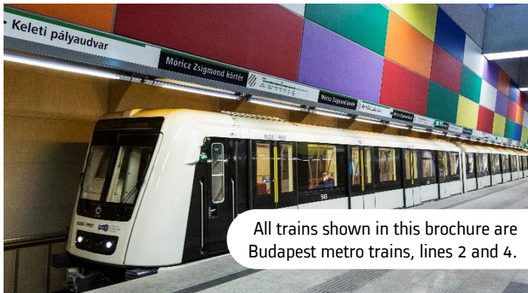
All trains shown in this brochure are Budapest metro trains, lines 2 and 4.